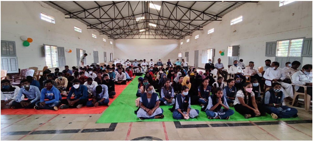
Students attended the Programme