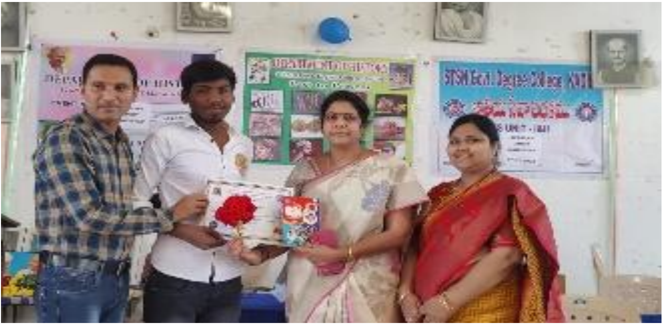
Certificates Distribution to the students, those who are participated in the QUIZ and Essay Writing