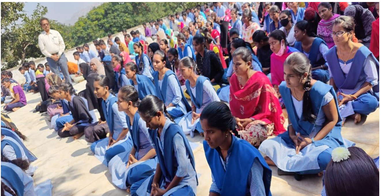
Yoga Workshop Photos