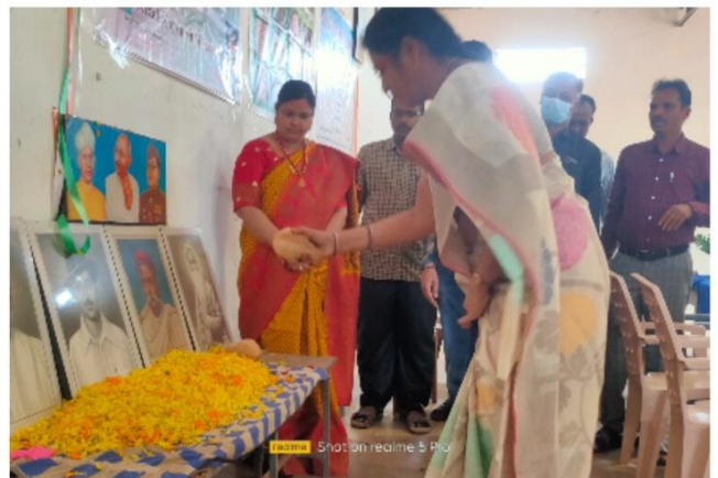
Various Activities of the Programme