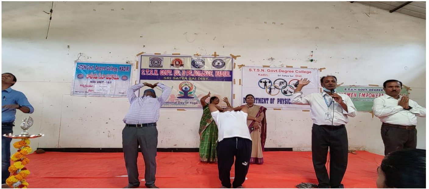
YOGA Master and Experts at Workshop