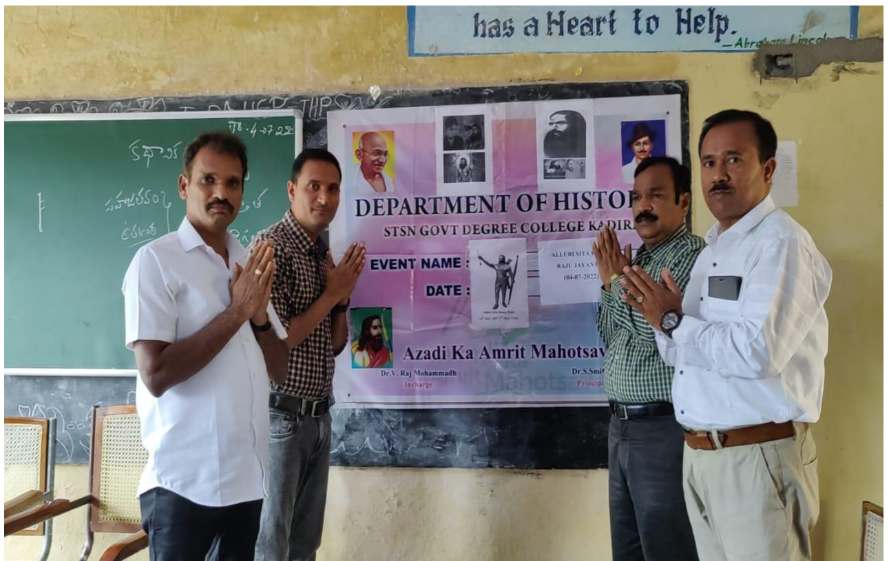
Tribute to Alluri Sita Rama Raju, Freedom Fighter by Staff