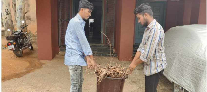
Students collecting foliage and other Natural waste from the college premises