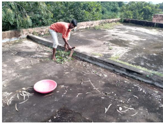
Cleaning of upstairs by the students