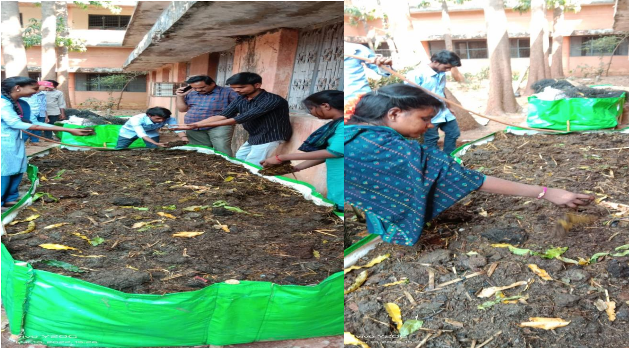
4. The entire bin is ready for making vermicompost.