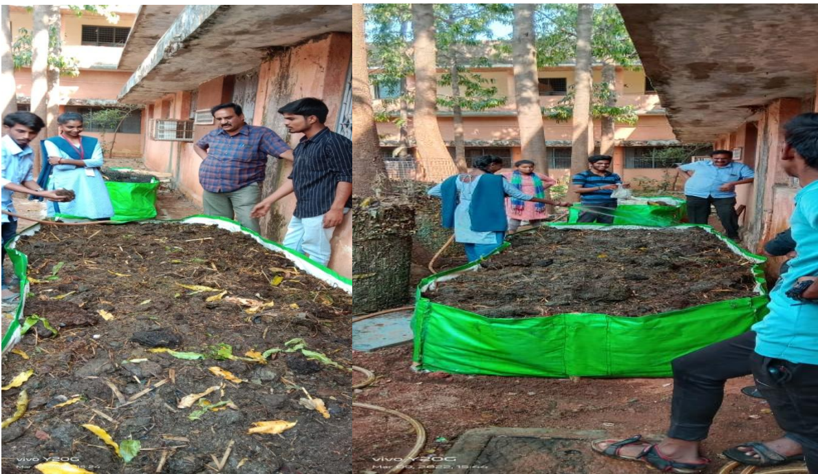
5. Strict supervision and water management of the vermicompost is a primarrequisit